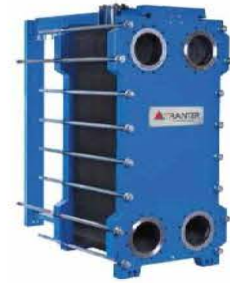
Gasketed Heat Exchanger