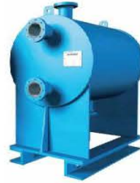
Shell & Plate Heat Exchanger